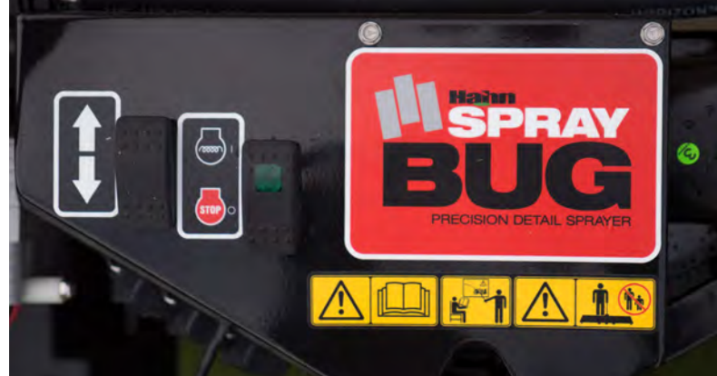
The Spray Bug can be operated in both directions with a flip of a switch.