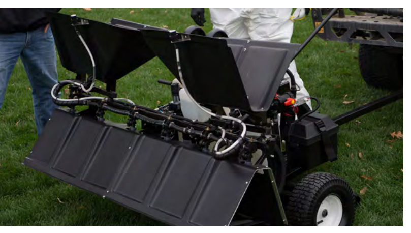
The outer wings and the handle fold up for compact transport.

The Spray Bug operates at a consistent 2.6 miles per hour with a cruise control that maintains that speed over rolling terrain for accurate calibration. Turning is easy and adjustable stops can be set to help in lining up for the next pass. A trailer is available for transportation around the golf course.