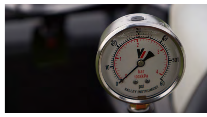
Calibration is easy by adjusting the pressure bypass valve.