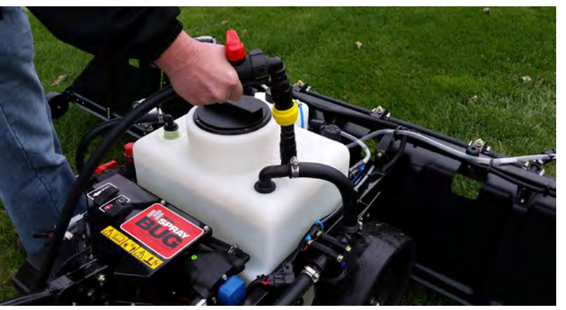
A dry lock fitting allows the operator to recharge the tank without exposure to the spray material.