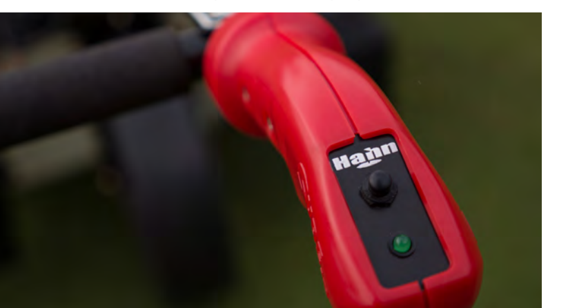
Convenient power drive switch and spray control switch are located at the operator's fingertips.