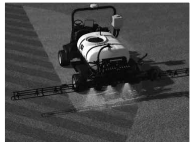
GeoLink's individual nozzle control saves time and money.

WAAS: The Wide Area Augmentation System (WAAS) was developed to augment the Global Positioning System (GPS), with the goal of improving its accuracy, integrity, and availability. RTK: Real Time Kinematic (RTK) satellite correction is a technique used to enhance the precision of position data derived from satellite-based positioning systems, being usable in conjunction with all positioning platforms.