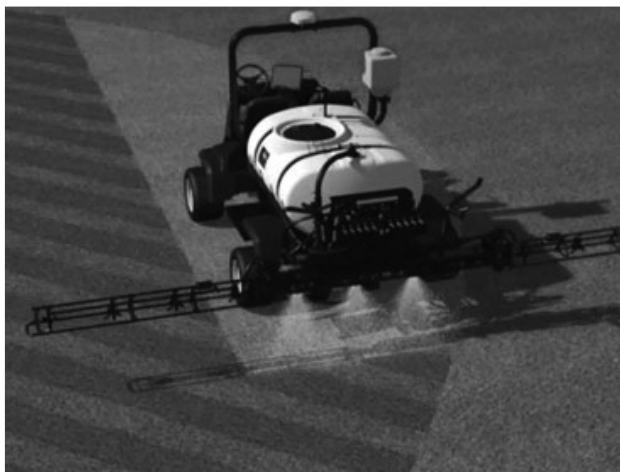
GeoLink's individual nozzle control saves time and money.

RTK: Real Time Kinematic (RTK) satellite correction is a technique used to enhance the precision of position data derived from satellite-based positioning systems, being usable in conjunction with all positioning platforms.