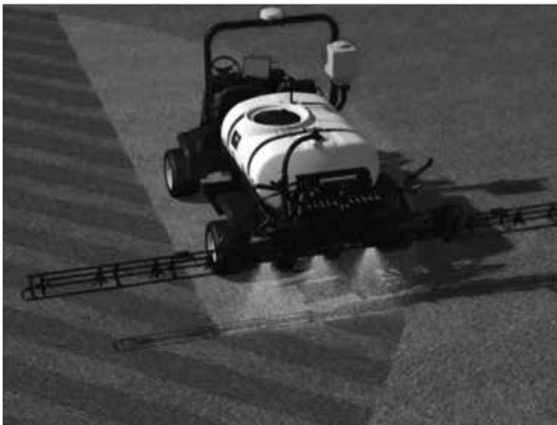
GeoLink's individual nozzle control saves time and money.

RTK: Real Time Kinematic (RTK) satellite correction is a technique used to enhance the precision of position data derived from satellite-based positioning systems, being usable in conjunction with all positioning platforms.