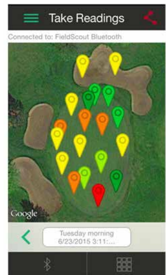
FieldScout Mobile App Pro version showing a Google Map view of a golf green in Freeform Mode