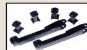
GL-TA Frame/Truck Kit