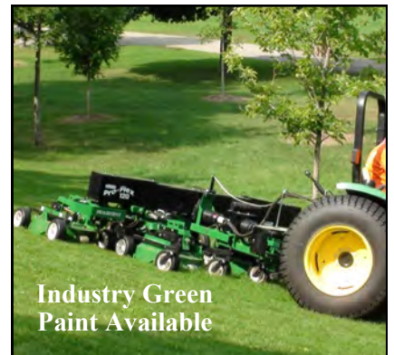
Industry Green Paint Available